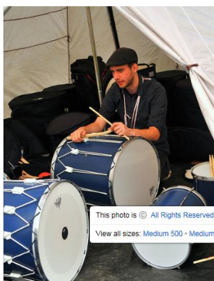
This photo is © All Rights Reserved View all sizes: Medium 500 - Medium